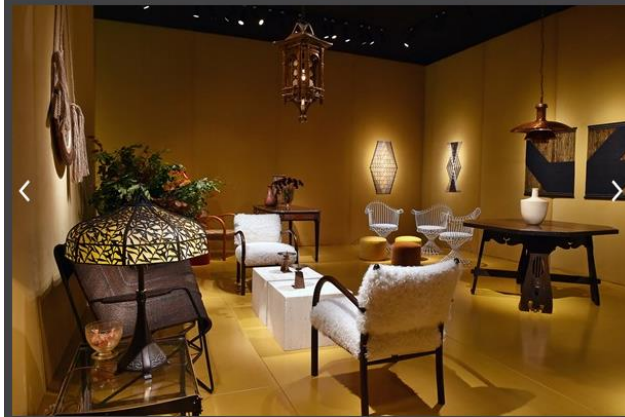
📷 Rose Uniacke has won best stand at PAD London.