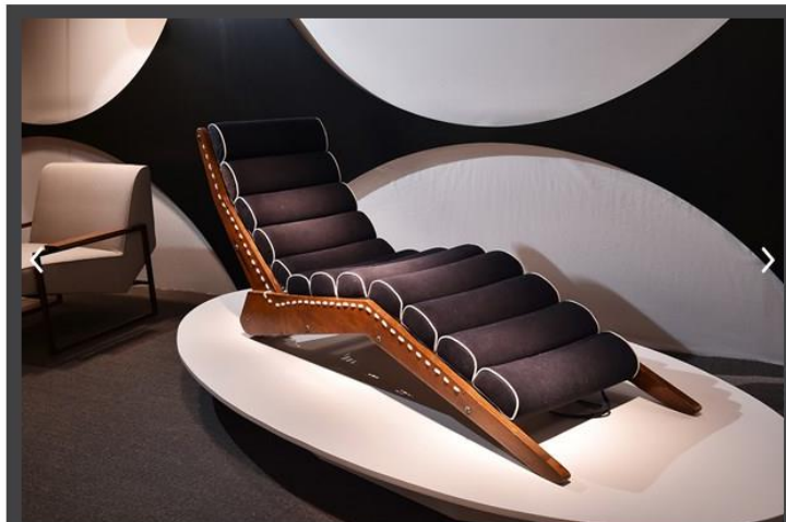
📷 Jose Zanin Caldas' plywood lounge chair (1949) which won best 20th century design on the stand of Galerie le Beau at PAD London.