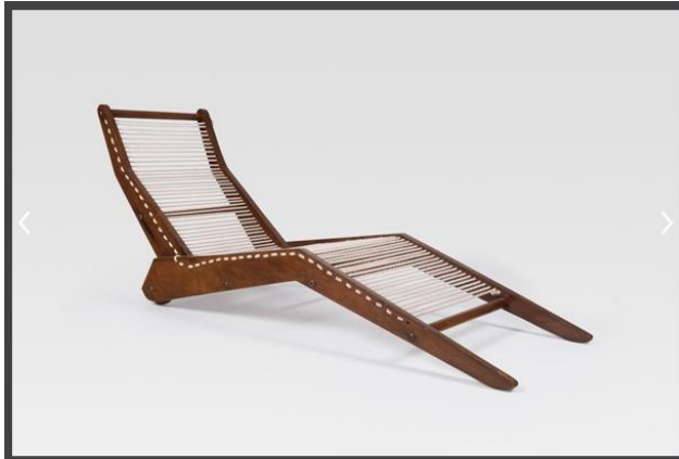
📷 Jose Zanin Caldas' plywood lounge chair (1949) which won best 20th century design on the stand of Galerie le Beau at PAD London.